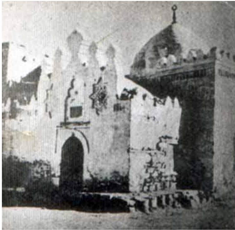
HOUSE OF BIBI FATIMA(S.A.) (MADINA)