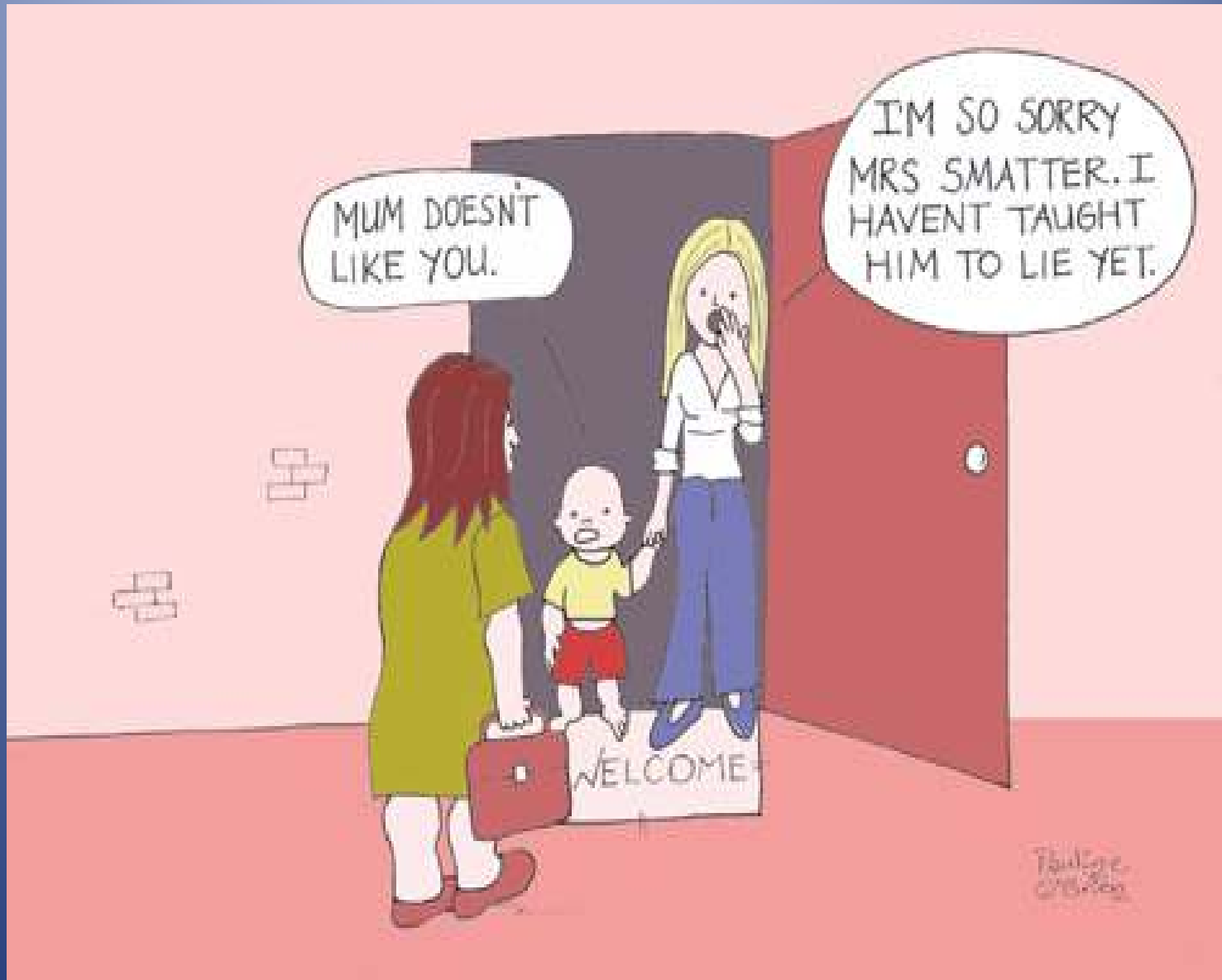
A.L.I. online course: Parenting Challenges Facing Muslims Today - Spring 2011