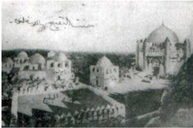
JANNATUL BAQI BEFORE DESTRUCTION (MADINA)