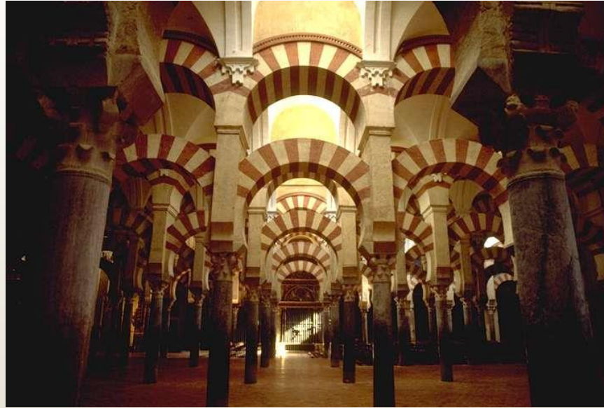
Example of Spain