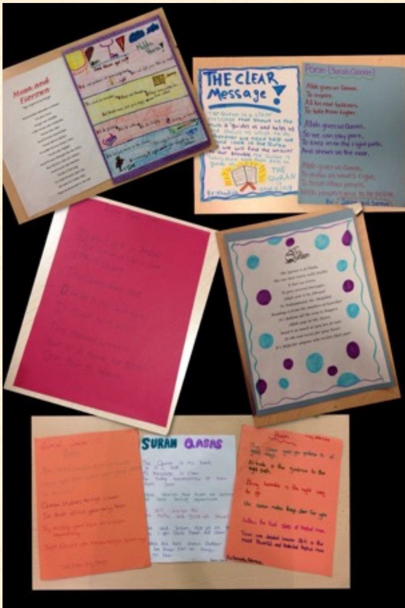
Poetry book on Sura Qasas