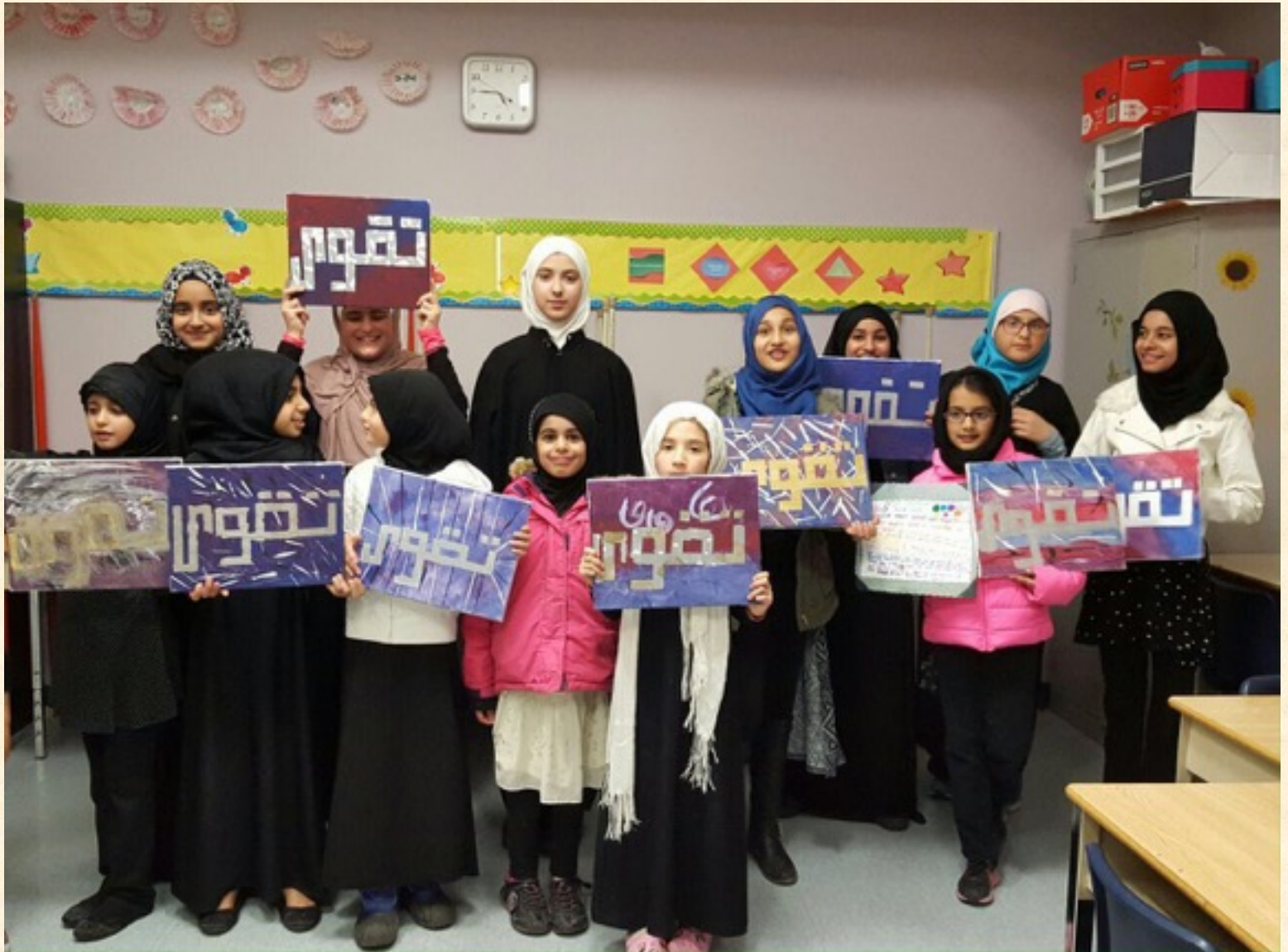
Arabic Calligraphy Art Project for Sura Yusuf