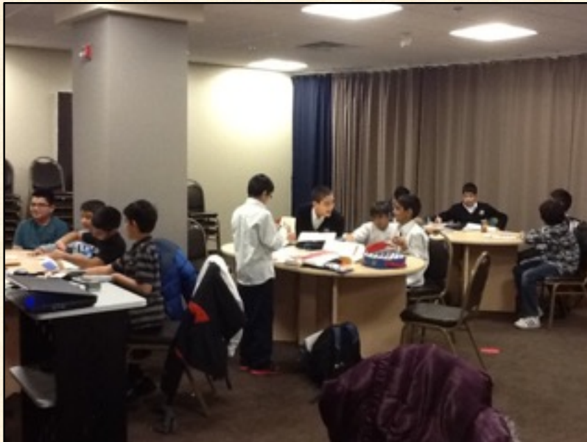
Quran Appreciation class in session