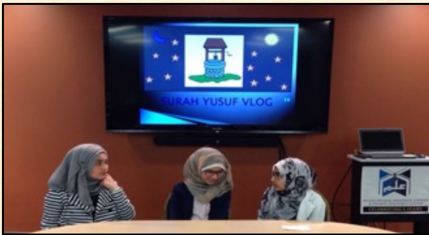
Vlog on Sura Yusuf