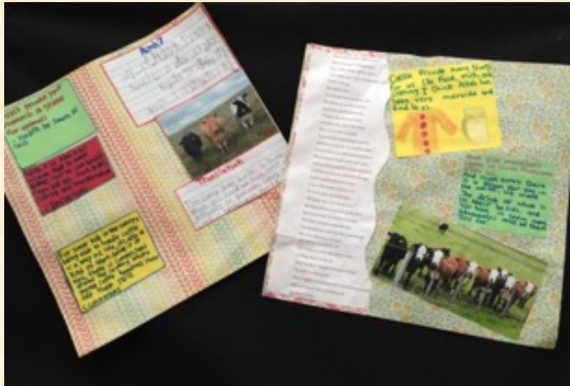
Scrapbook pages on Sura Nahl