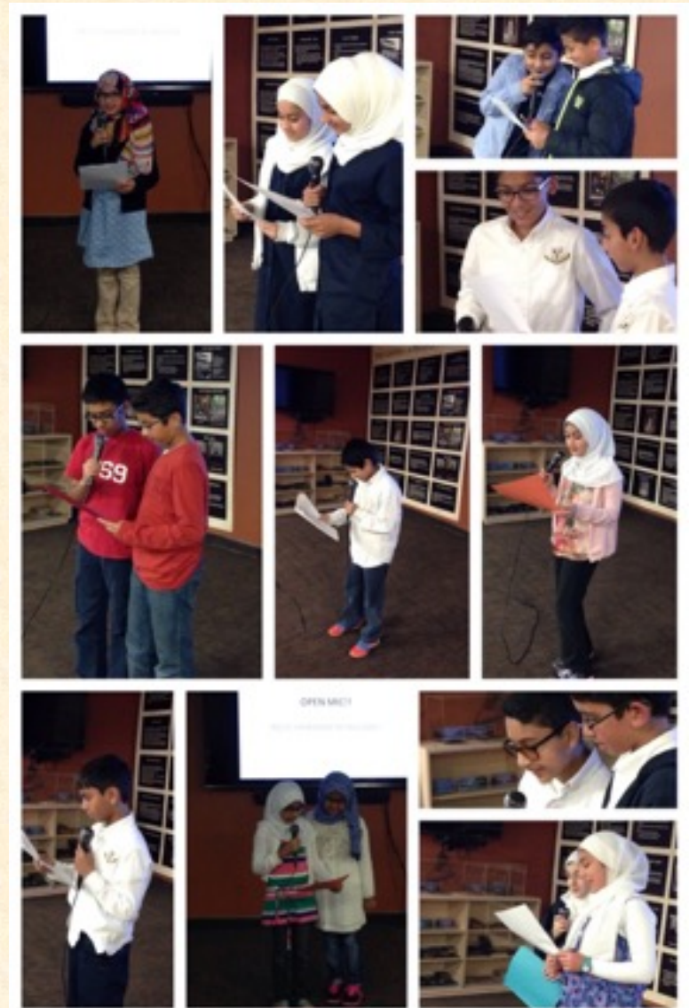
Reading poems on Sura Qasas