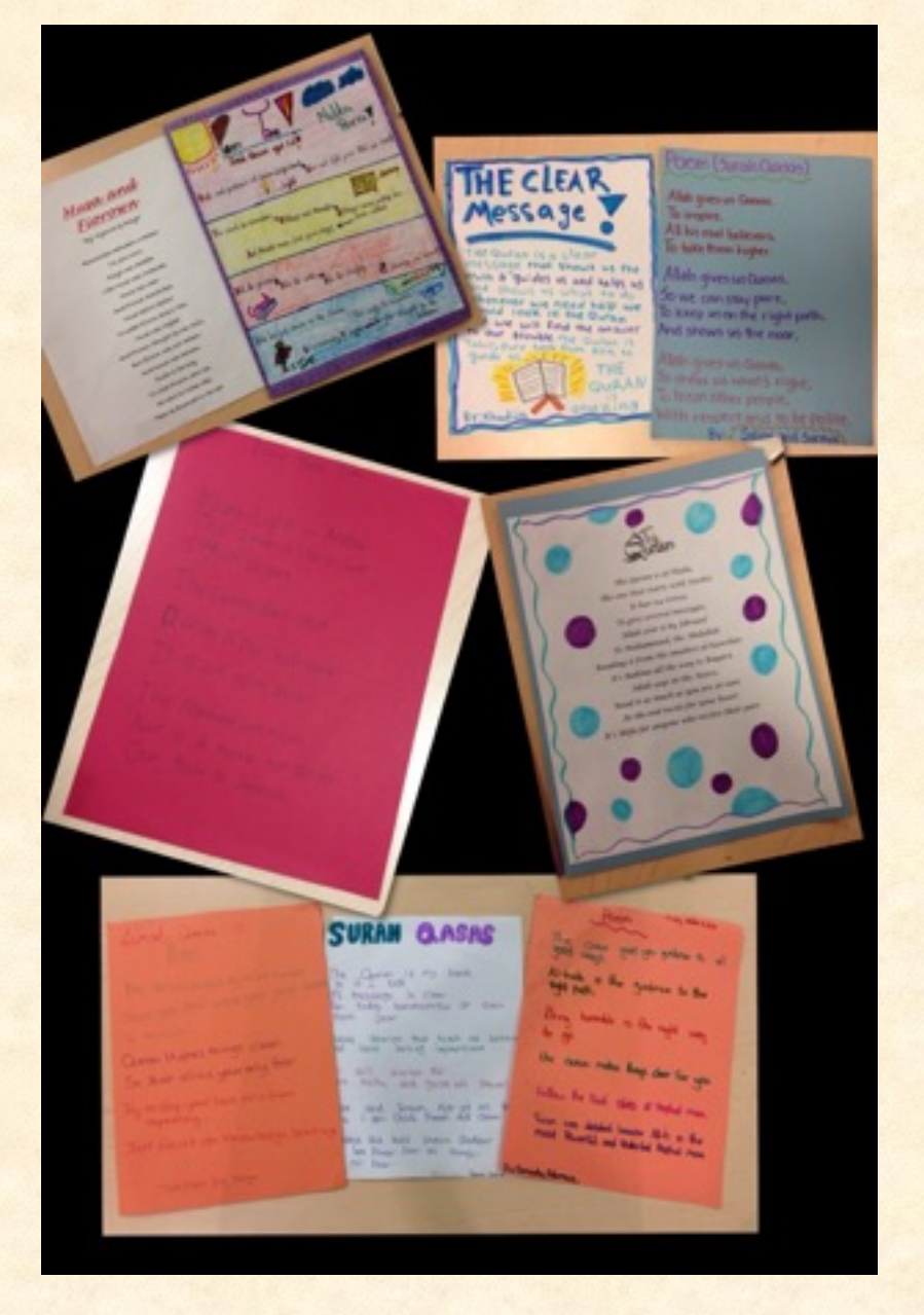
Poetry book on Sura Qasas