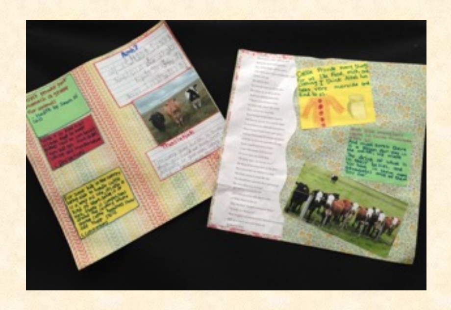
Scrapbook pages on Sura Nahl