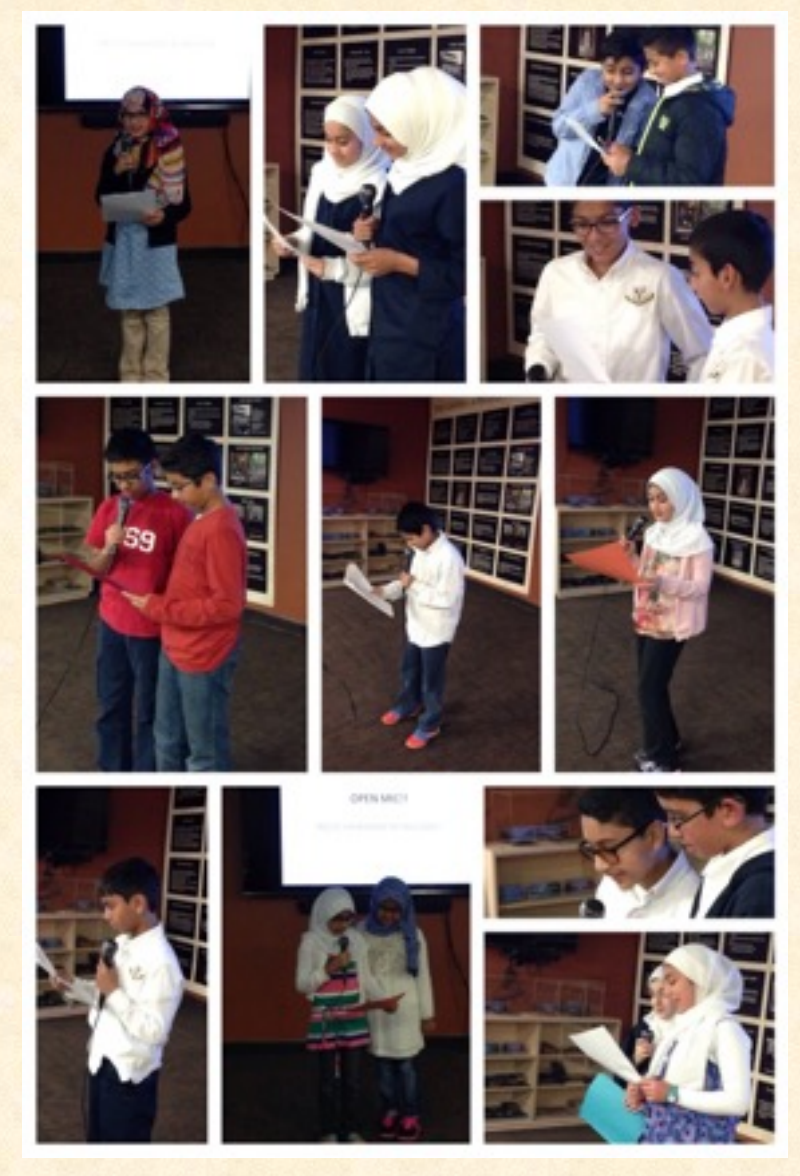
Reading poems on Sura Qasas