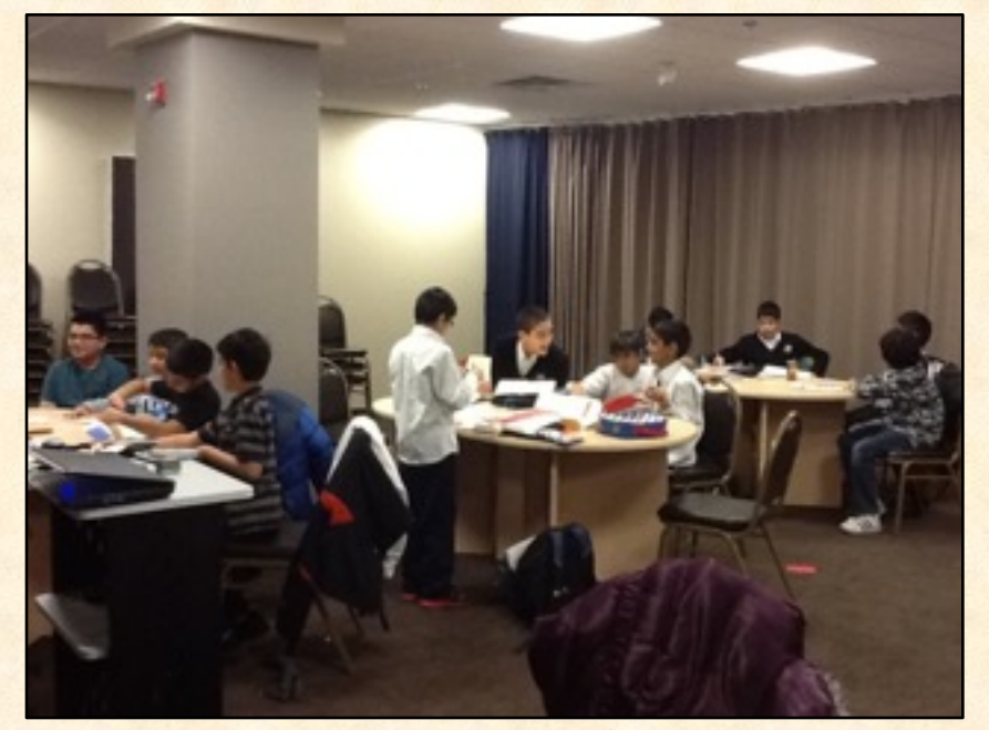
Quran Appreciation class in session