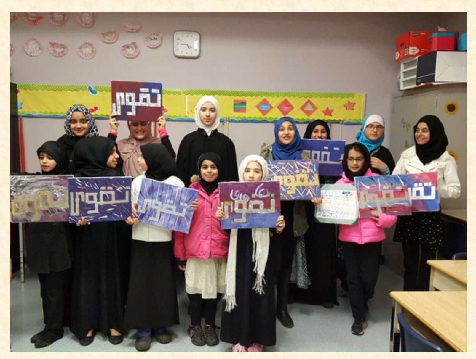
Arabic Calligraphy Art Project for Sura Yusuf